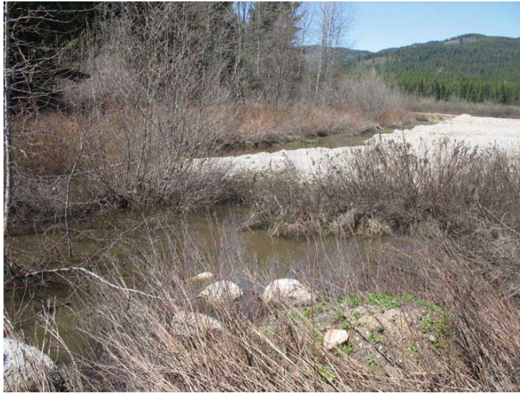
View north from Old Schneiders Road of south and west edges of property, taken during 2008 site visit.