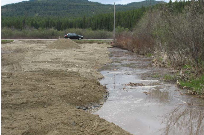
East side of the lot showing strip of excavated ground that was being filled when EPA officials arrived, taken during 2007 site visit.