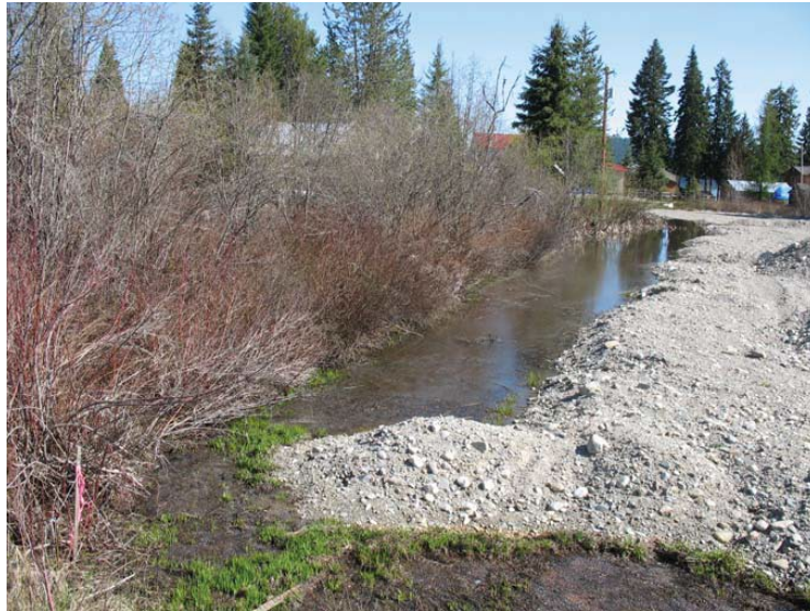
View south from Kalispell Bay Road along east edge of Sackett property, taken during 2008 site visit.