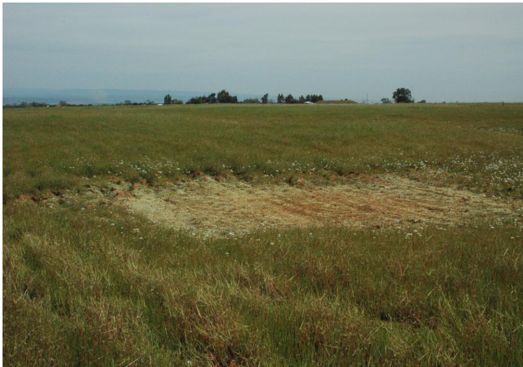
Exhibit 89: Shallow Tillage at Duarte Property, with Wetlands in Full Bloom

What they actually saw on Duarte's property was farm and pastureland tilled a few inches deep to plant winter wheat, with the wetlands in full bloom even in a historic drought: