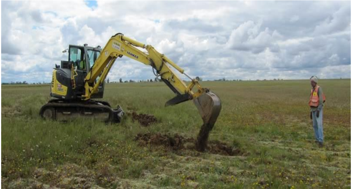
16 Exhibit HU: No Harm To Fairy Shrimp Here

1 The Corps gave itself a Clean Water Act permit for this work, in consultation with the U.S. 2 Fish and Wildlife Service, on the basis of representations by the Department of Justice and its 3 experts in this case that digging deep pits and trenches on the property would not harm listed species 4 such as fairy shrimp. (Exhibits EL-ER, EU.)