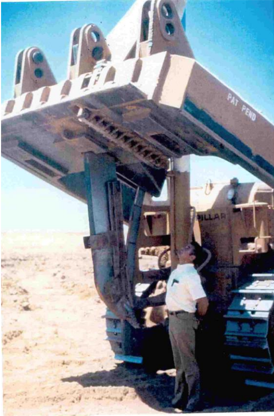
Exhibit BJ: A Real Deep Ripper

1 2 3 4 5 6 7 8 9 10 11 12 13 14 15 16 17 18 19 20 21 22 23 24 25 26 27 28