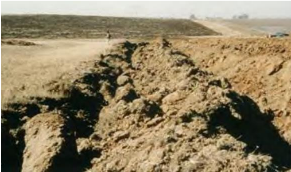
Exhibit D: Deep Ripping at Borden Ranch

When the Corps’ lawyers and experts first got this case, Corps staff had led them to believe that the Duarte property would resemble the deep-ripped moonscape left at Borden Ranch (leading to Borden Ranch P’ship v. United States , 261 F.3d 810 (9th Cir. 2001)), after industrial-sized equipment dragged steel shanks five to seven feet deep through the soil to break up the restrictive subsoil layer necessary for vernal pool wetlands to form and persist on the surface: