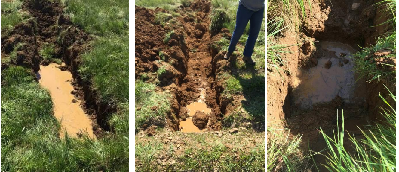
Exhibits FC, FD, FH: Water Pooling Above Restrictive Layer In DoJ Experts' Pits

But the Corps' experts were being paid well to write a report, and so a report they wrote. It ended up long on background and short on analysis. While the experts dug a lot of pits and trenches, they ran no real tests and gathered very little data. Their actual analysis of impacts was reduced largely to eyeballing the wetlands and speculating about impacts. What the report lacked in real science it made up for in hyperbole. It analogized the tops of plow furrows to "small mountain ranges", and the tillage to a "tornado" that "completely uproots and rearranges" "a town". The capper was the opinion that the effect of Duarte's tillage "was functionally the same" as the deep ripping done at "Borden Ranch". With that, the Corps asserted—and now must prove—the following: