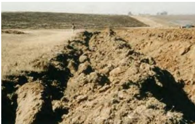
Borden Ranch deep ripping

But the Corps' experts were being paid well to write a report, and so a report they wrote. It ended up long on background and short on analysis. While the experts dug a lot of pits and trenches, they ran no real tests and gathered very little data. Their actual analysis of impacts was reduced largely to eyeballing the wetlands and speculating about impacts. What the report lacked in real science it made up for in hyperbole. It analogized the tops of plow furrows to "small mountain ranges", and the tillage to a "tornado" that "completely uproots and rearranges" "a town". The capper was the opinion that the effect of Duarte's tillage "was functionally the same" as the deep ripping done at "Borden Ranch". With that, the Corps asserted—and now must prove—the following: