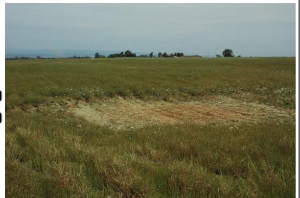
Duarte shallow tillage